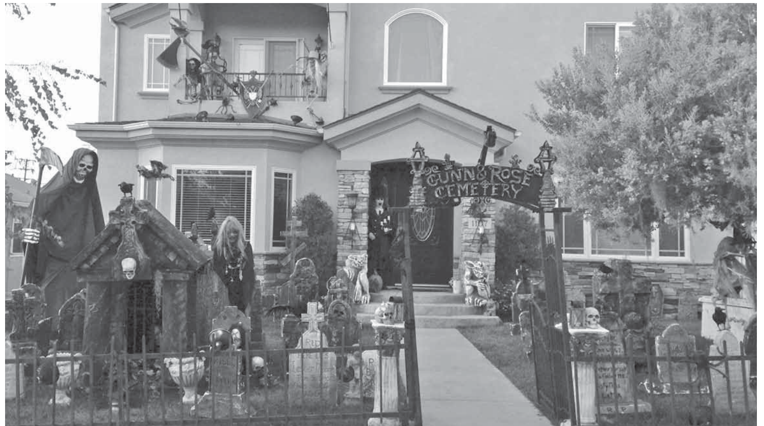
Residents throughout the South Bay celebrate the season with creatively creepy home décor. At this South Bay home, the featured "Gunn & Rose Cemetery" is sure to come to life Halloween night as goblins and ghouls keep watch over graves.